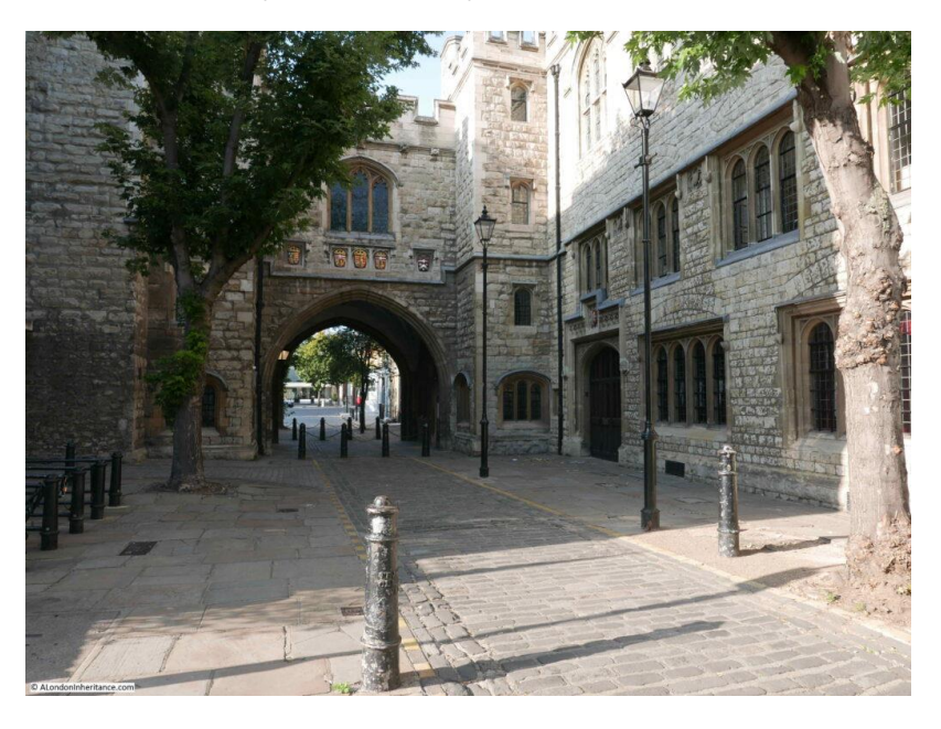
The entrance to the Priory of the Order of Saint John of Jerusalem

Who were the original Knights of St John of Jerusalem? Why were they so revered throughout Europe and given land to build a priory in London in medieval times?