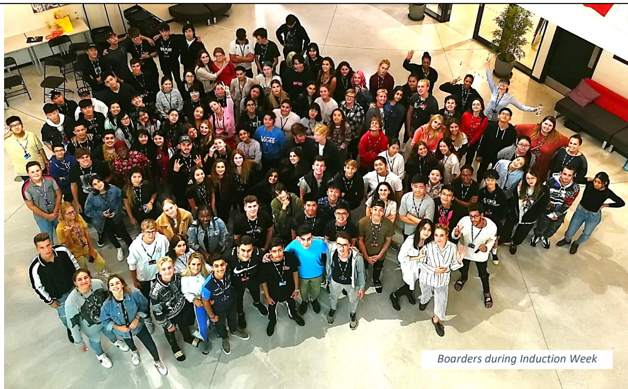
Boarders during Induction Week