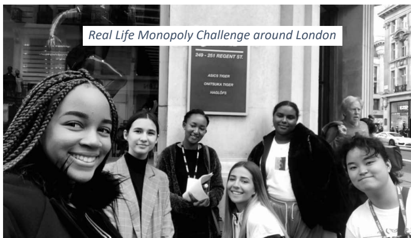
Real Life Monopoly Challenge around London