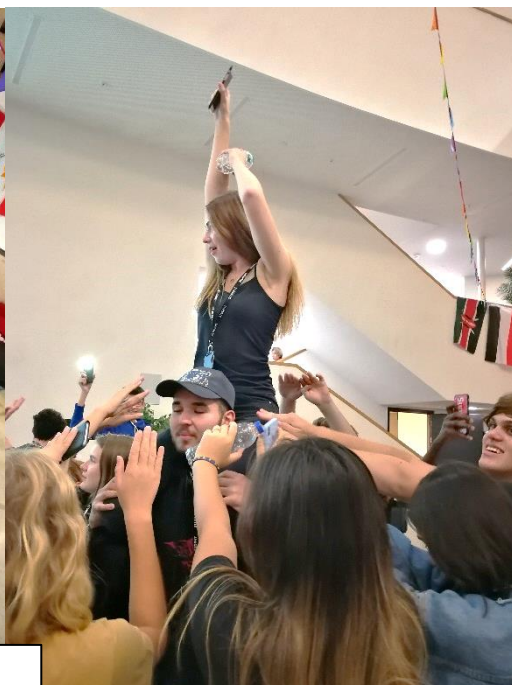
Boarders' Induction Teambuilding Activities