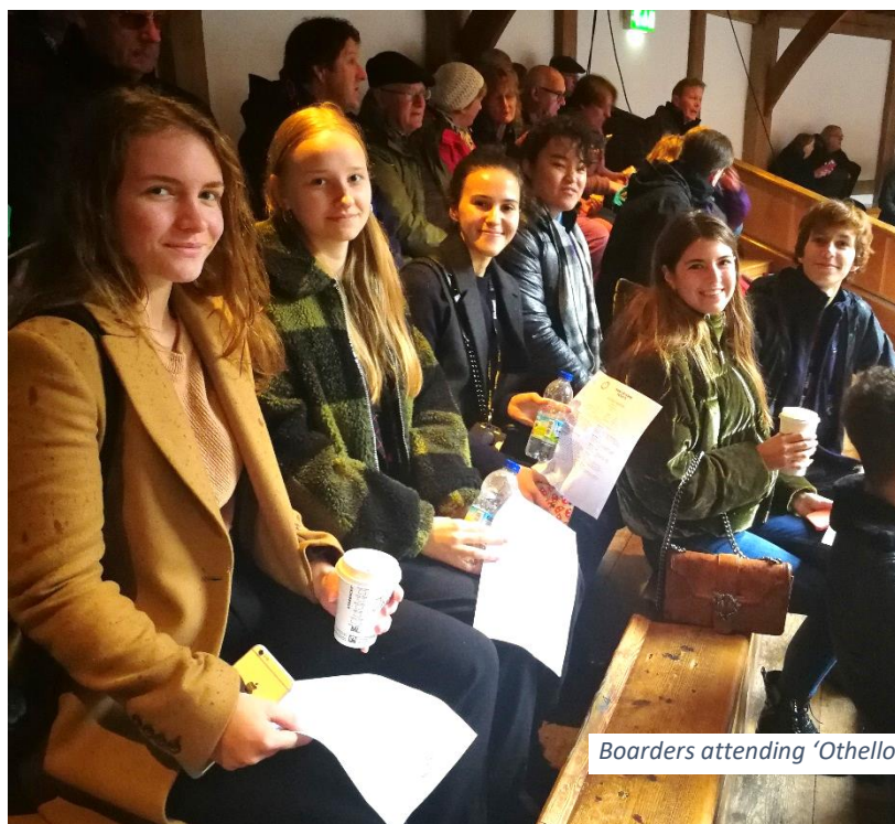
Boarders attending 'Othello' at The Globe Theatre

It is fabulous to see so many students taking advantage of their time in London by signing up for these trips en masse! Long may it continue!