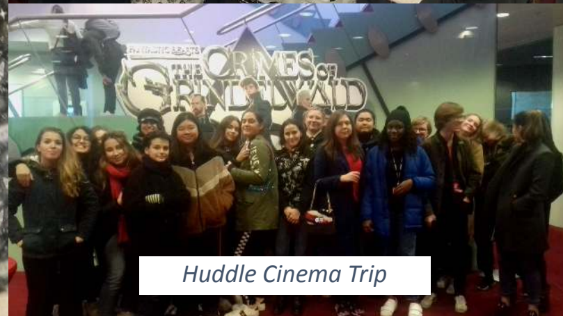
Huddle Cinema Trip