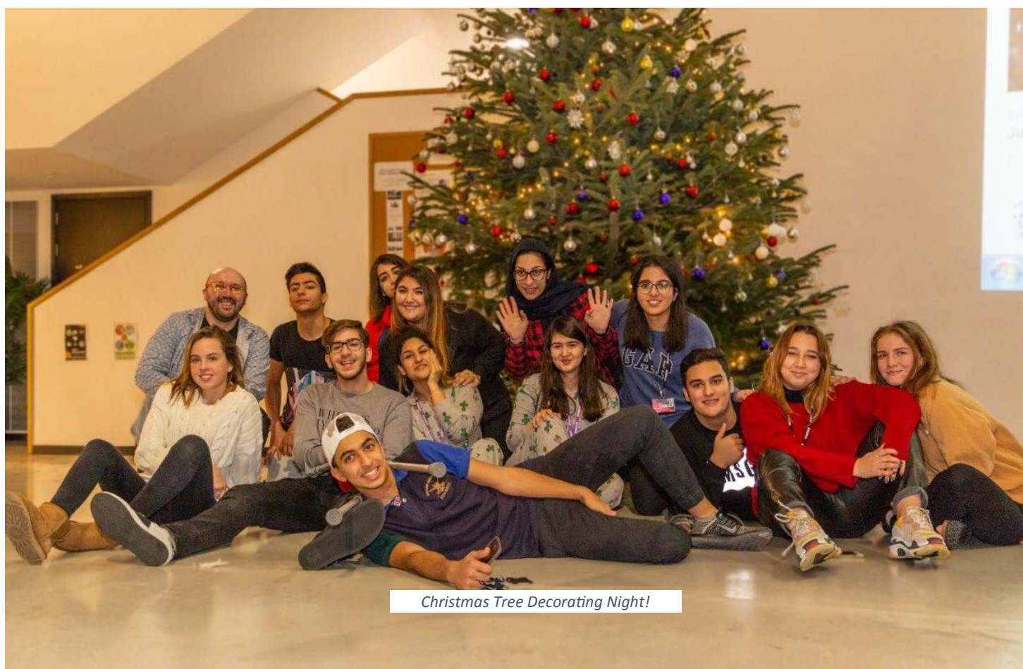
Christmas Tree Decorating Night!