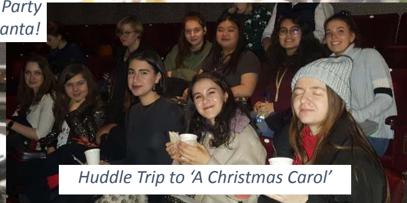
Huddle Trip to 'A Christmas Carol'