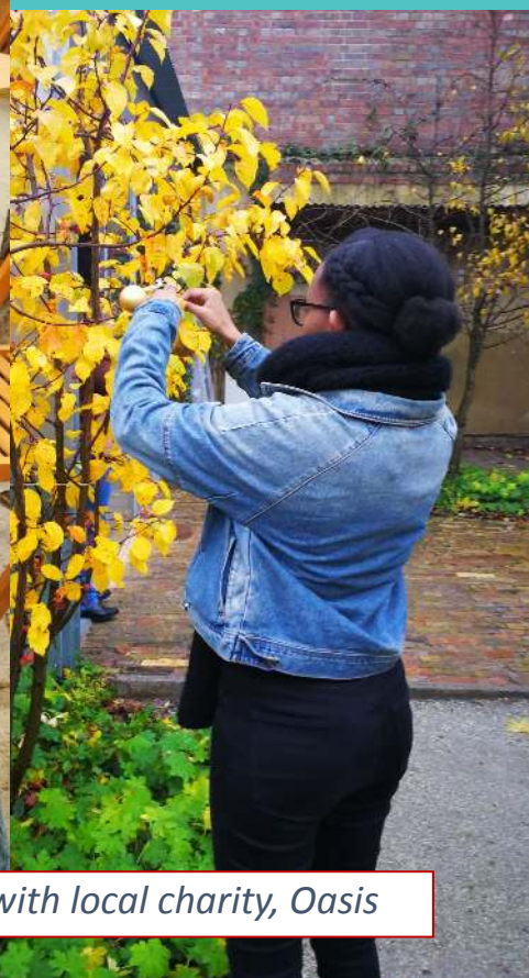
Boarders helping set up for a Christmas Fair with local charity, Oasis